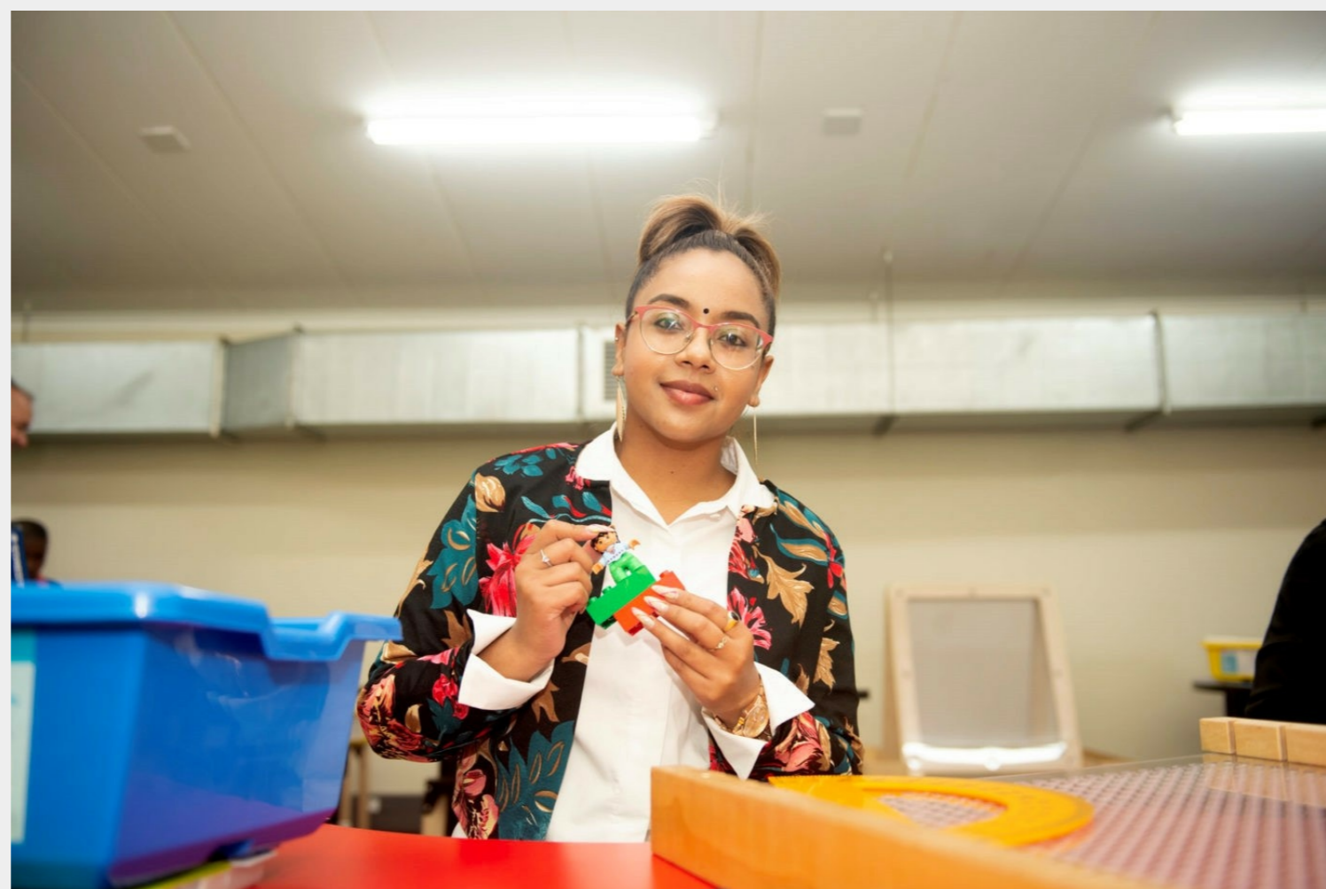
Shaping the Future: Kiyara's commitment to making a positive difference in South African Education