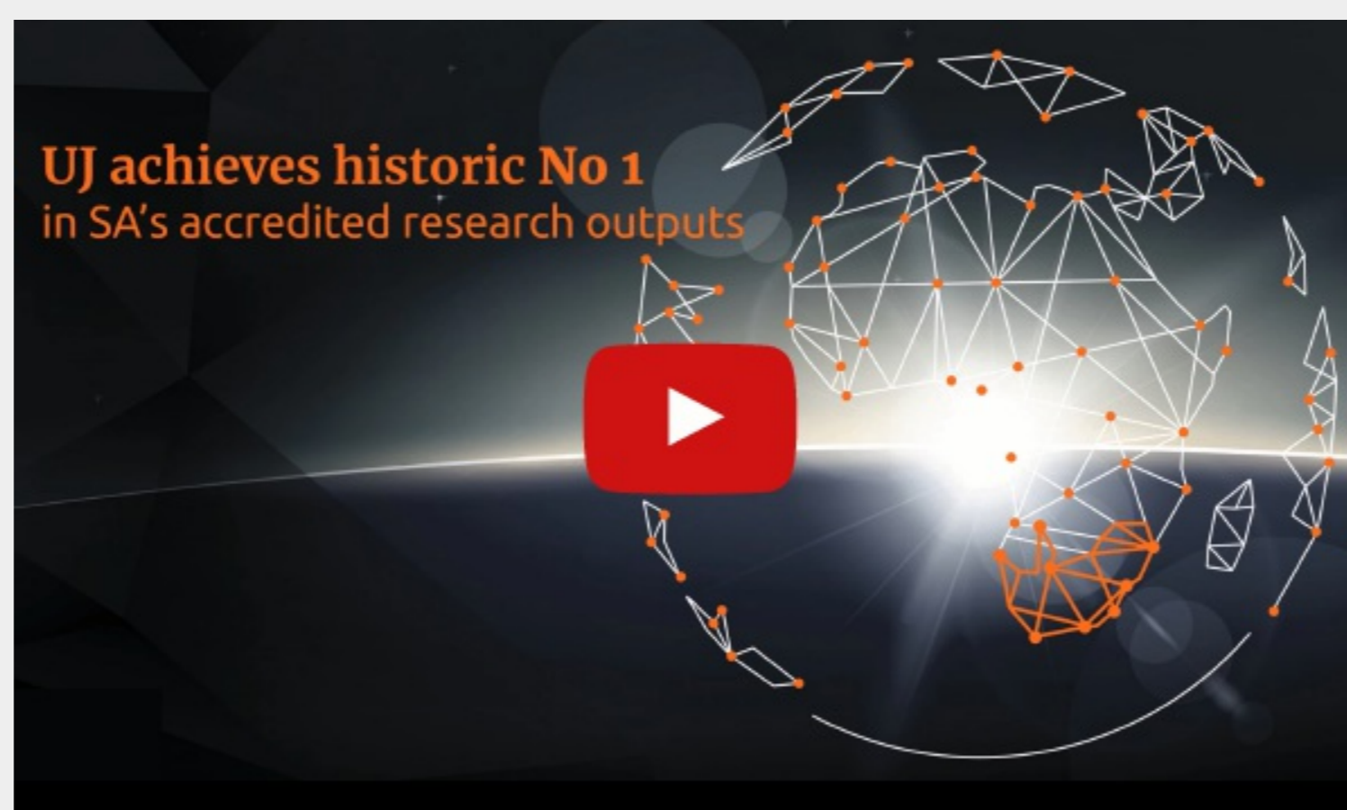
UJ achieves historic No 1 in SA's accredited research outputs

Interior designers are architects of spaces, says UJ alumni Eitan Malkin