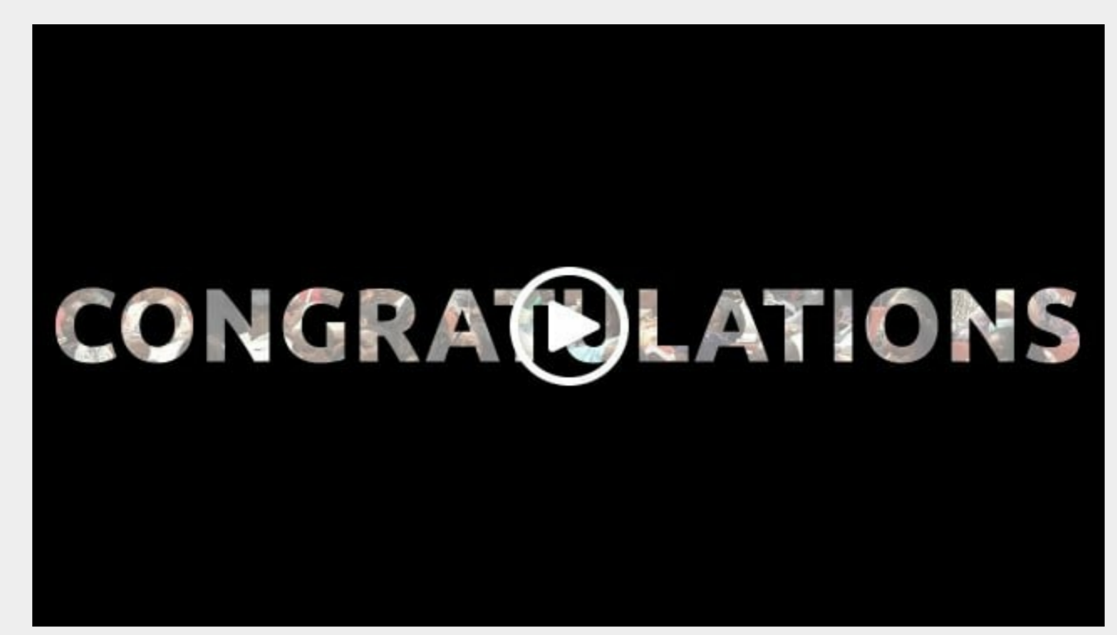
Jubilant scenes at the UJ 2024 Autumn Graduation ceremonies